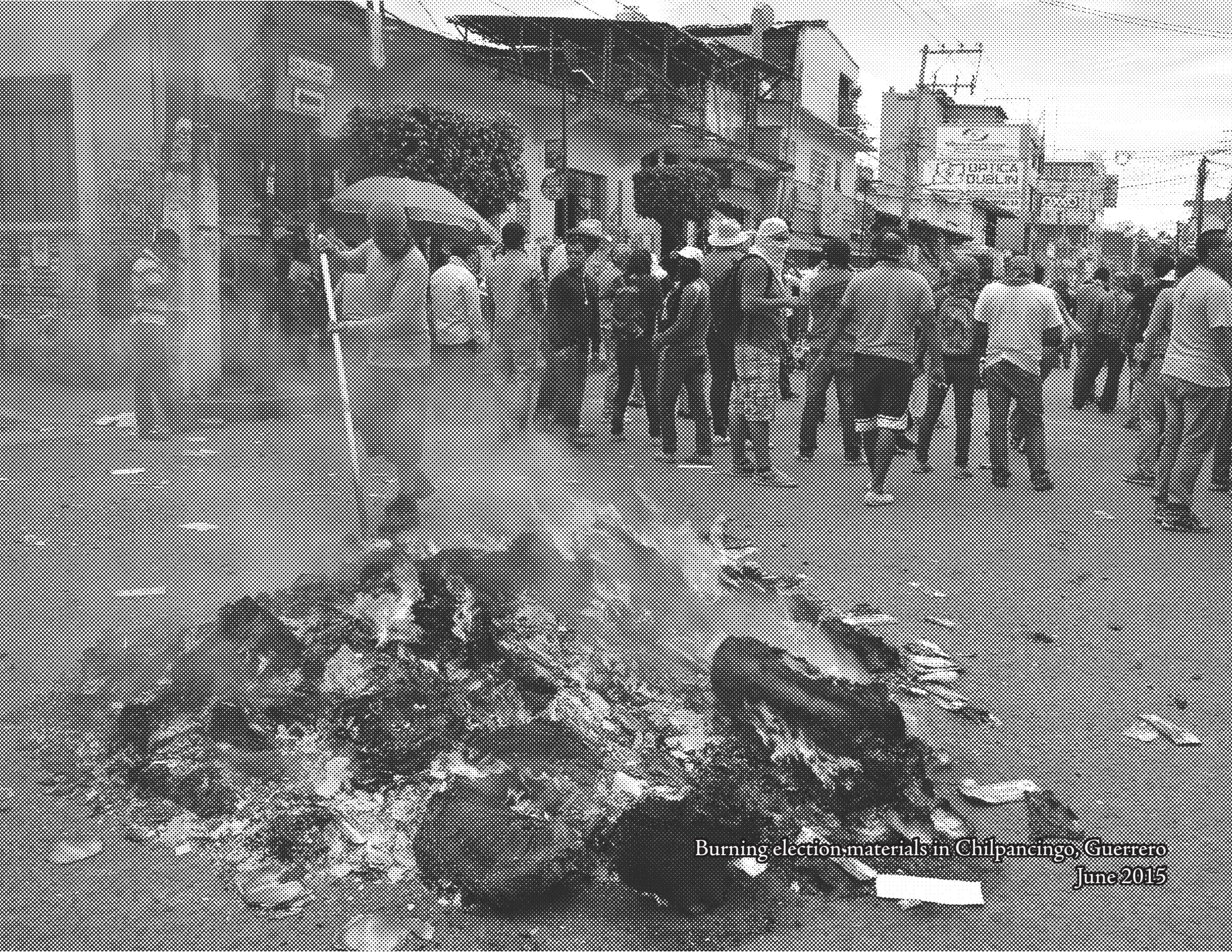
Burning election materials in Chilpancingo, Guerrero June 2015