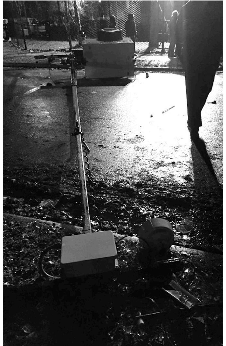
Downed surveillance camera, November 18th